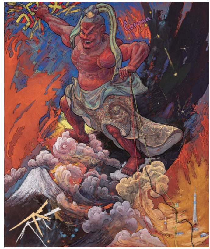
Deva King in the Sky (Tenku) - Katsu (I and II) I: 2020 II: 2021 Mixed media work

Finally, "The Blue Sky and the Earth/Sadness that Seeps into the Heart (II)" (2022 mixed media 2273 x 1818 shown on the cover). This is the sequel to "Blue Sky, Great Earth: Sadness Fills the Heart", displayed at the 89th Dokuritsu Exhibition (October 19 (Wed) – 31 (Mon), 2022, The National Art Center), lamenting the current world situation as well as presenting a strong message for peace. The atypical ancient wooden statue with an air of requiem and magic implies a sense of the vanity of life, in that everything will inevitably decay in the fullness of time. A mother and a child lying in the sand are painted behind it with a wooden figure snuggling up to them. Black smoke is rising from far beyond the red horizon into the clear blue sky with a machine gun wrapped in the national flag of Ukraine peeking out at the lower left. Based on a theme of war and peace, this work cries out the teaching of the Dharma Gate of Non-Duality as expressed in Kinutani's words: "No matter how much we pray for peace and continue to declaim the justness of such prayer, there are people who adopt exactly the opposite way of thinking. War and peace are not two separate concepts but, rather, two parts of the same whole. Hence, it is critical that we only talk about peace after capturing the whole picture through both eyes".